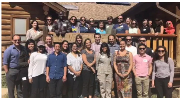
~ Photo: Leadership Fellows, Class of 2020 - click image to view video

~ Photo: Community Trust grant recipients at a reception at the Longmont Museum in January 2019